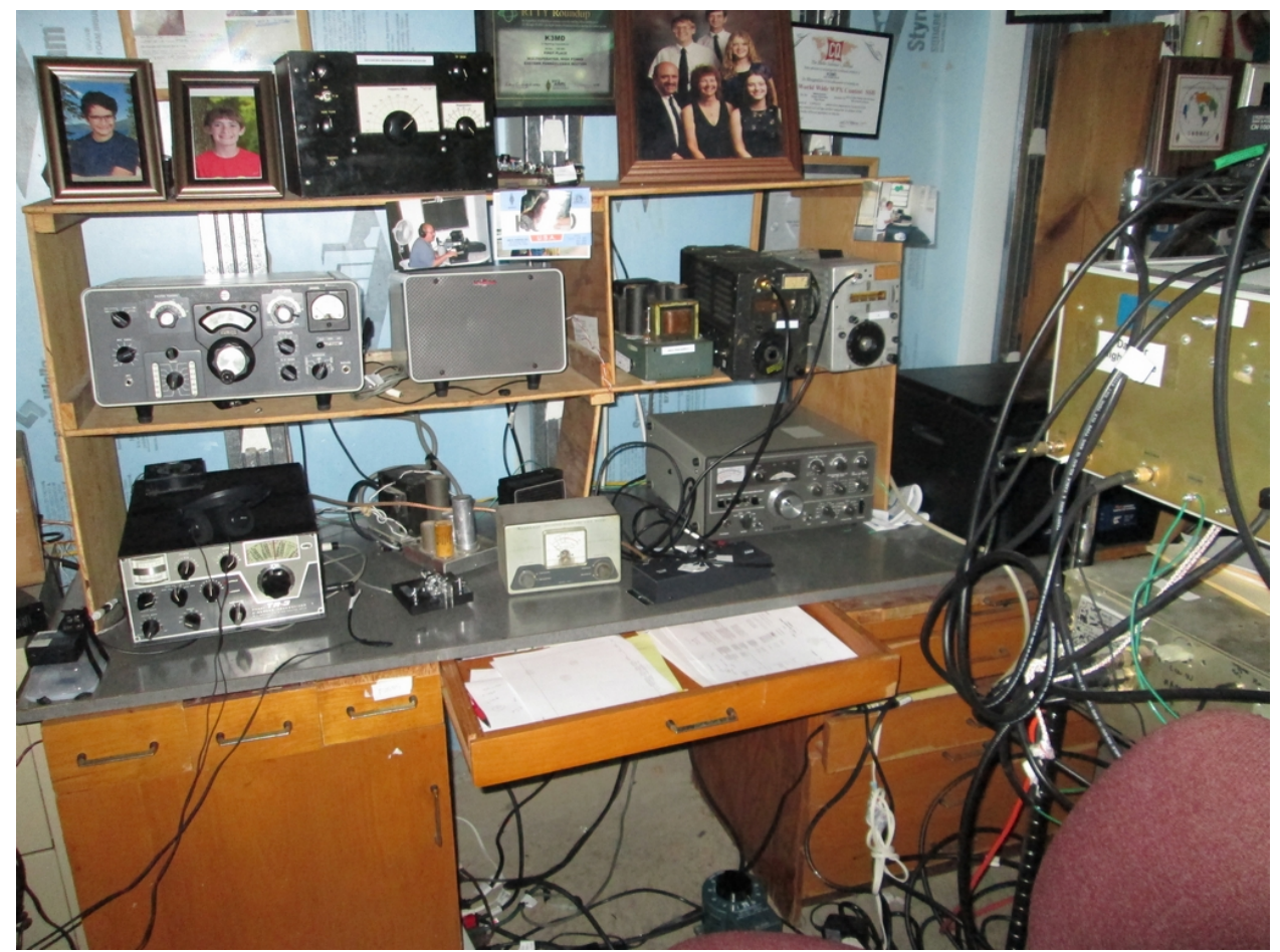
Advanced design regen rx, KWM-2A, ARC-5 40, ARC-5 80, TR-3, AM-2, TS-520SE