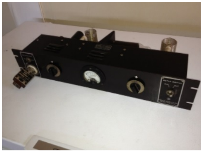
The 1947 Millen 90800 transmitter. 6L6 osc, 807 amp.