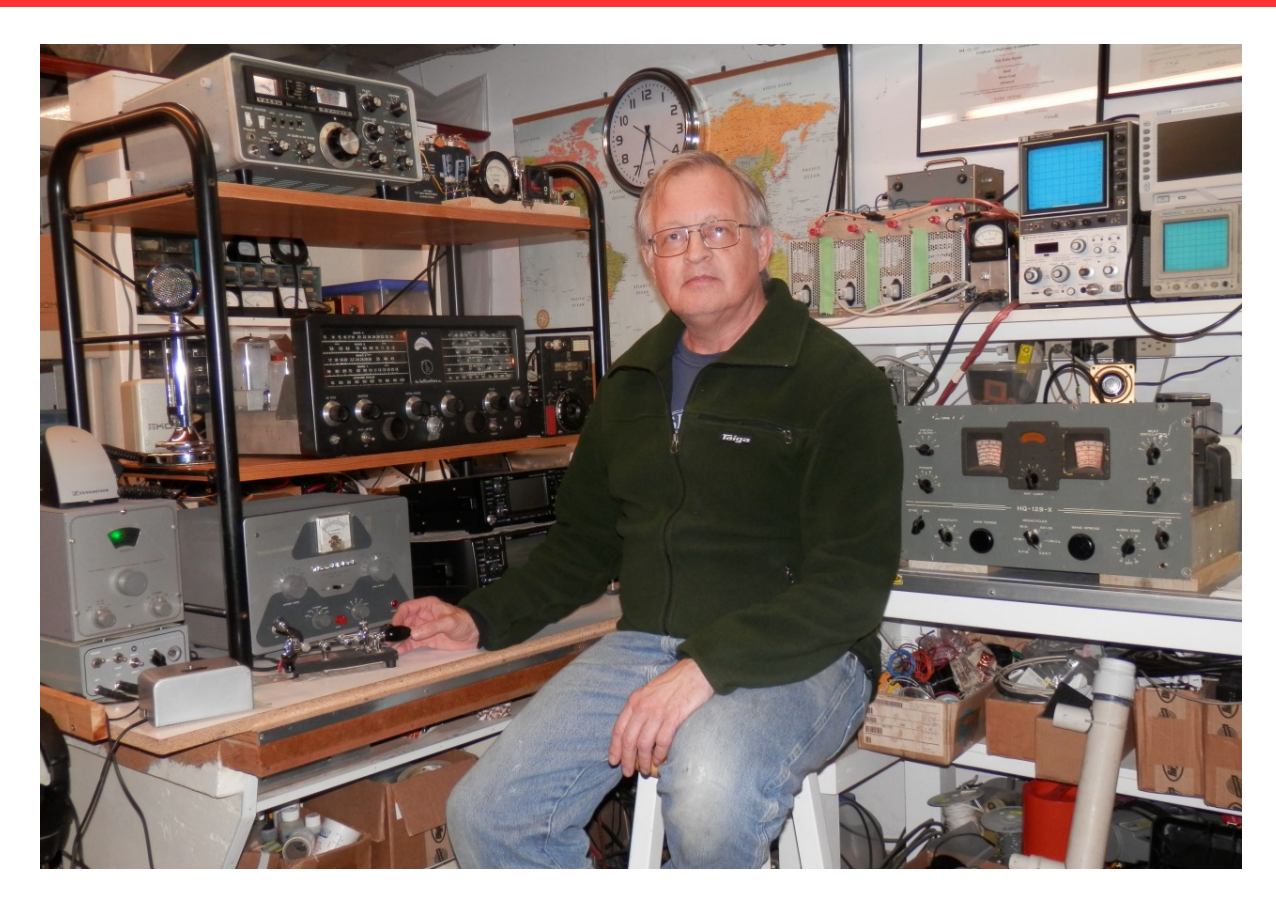
The SX-71 was quite sensitive but needed frequent tuning on 20-10m to keep CW signals in the passband. One mica capacitor failed in the HQ-129-X during the CW event, quickly repaired before the second day. The rigs were otherwise reliable.

Code keys were a 1952 Blue Racer and a Swedish straight key. The mic was a D-104 Silver Eagle. My antenna was a wire inverted L, 50ft high with a 70 ft sloping top load, with an AH-4 automatic tuner at the base.