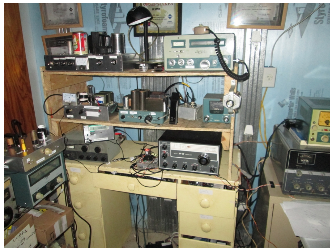
L to R, top to bottom: 6MJ6 homebrew, Heathkit MT-1, HB 6L6, HM-102, HB VFO amp, ARC-5 VFO, HG-10B, N3ZI VFO, Drake 2-C

Repaired my 40M QRP rig and changed the final to a 6L6. I built a homebrew VFO amp so this could be used with the N3ZI VFO. I repaired the TR-3 I purchased for $80... this required 2 weeks... it had about 20 things wrong with it. I could not use my KWM-2A as it locks up on CW.