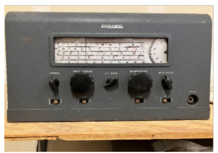
The Howard 435A receiver. Pretty lousy receiver but it's my namesake...