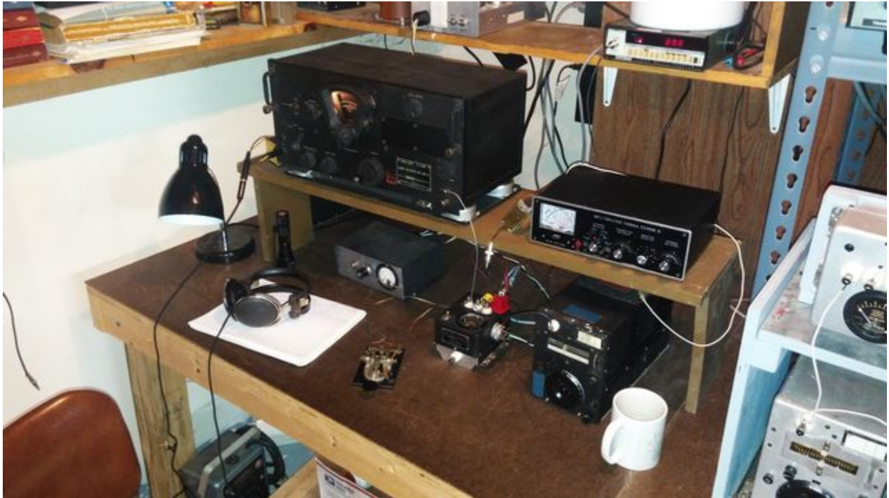
T-22 and BC-348R