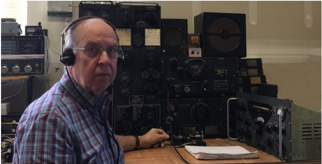
WB2AWQ mil gear GO-9, WW2 HRO, BC348Q, R388

There were no nasty surprises this CX – no heavy ozone smell, or burnt transformer tar, or smoked resistors, not even a blown fuse. I must have been doing something wrong.....See ya all in September!