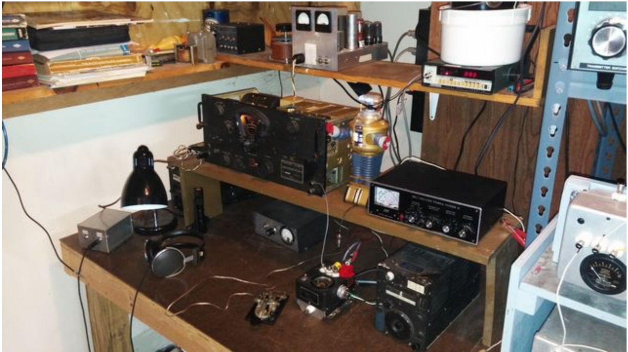
T-19 and Dynamotor powered BC-348Q