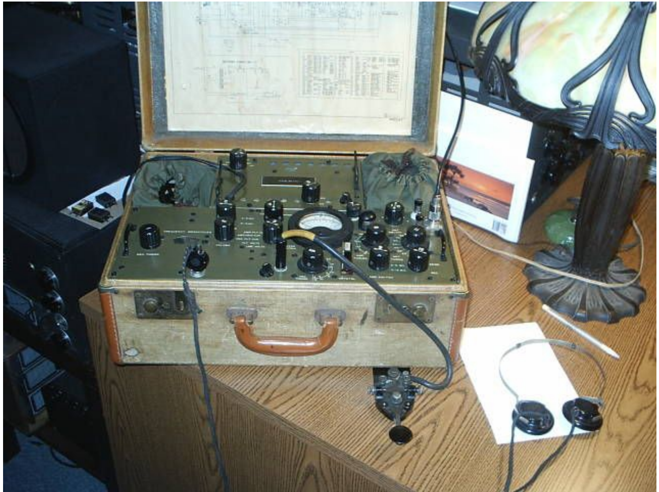
K9VKY's very nice PRC-1 Spy Radio