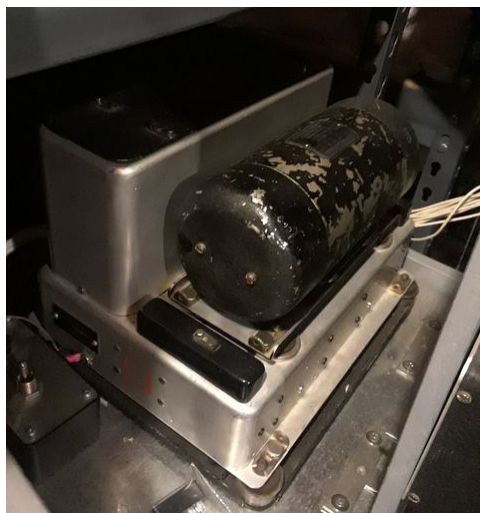
General Electric Dynamotor